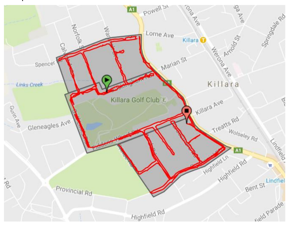
*Note: The grey area is the notification distribution catchment area and the coloured lines are GPS tracks of where the distributors delivered

A map of the distribution area is included below.